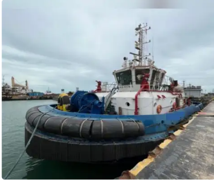
28m 55TP ASD